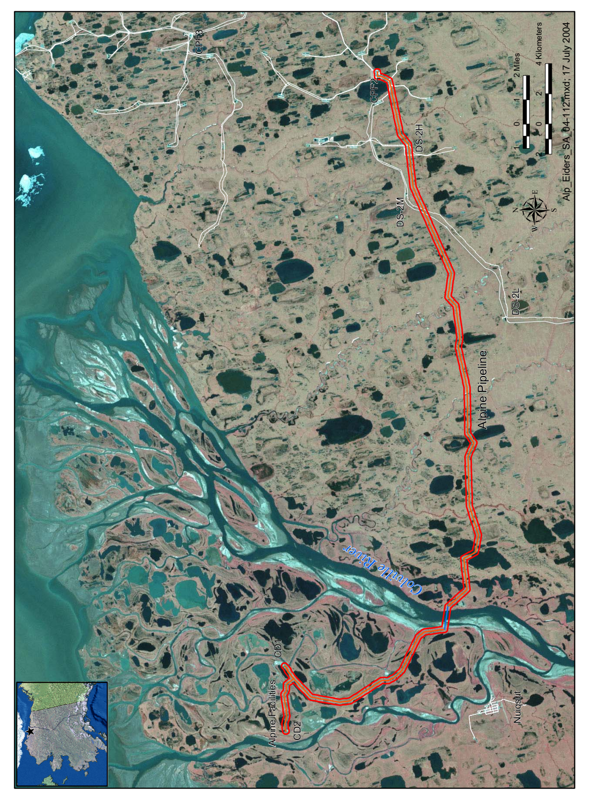
Study area for the Alpine Pipeline eider survey in the Kuparuk Oilfield and the Colville River Delta, Alaska, 2004. The aerial survey was conducted along a 400-m wide area on either side of the pipeline. Figure 1.