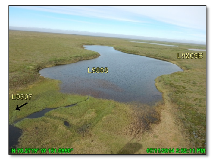
Photo B.5: Lake L9808 post-breakup, looking northeast; July 11, 2014