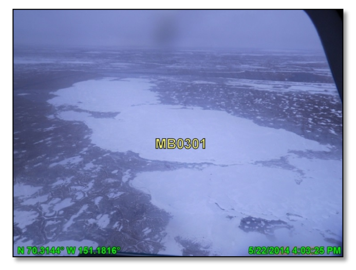
Photo B.8: Lake MB0301 pre-breakup, looking southwest; May 22, 2014