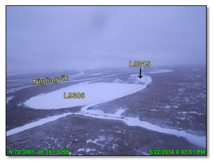
Photo B.1: Lake L9306 pre-breakup, looking southeast; May 22, 2014