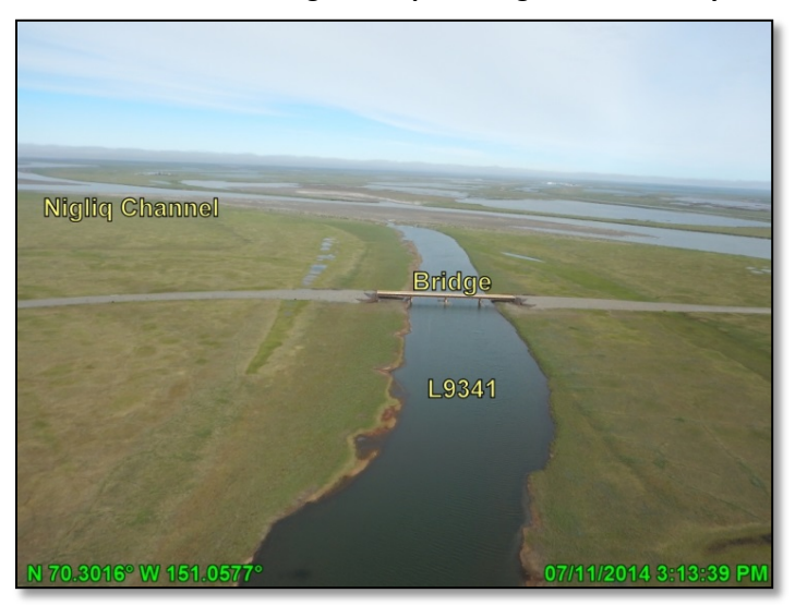
Photo B.4: Lake L9341 post-breakup, looking northeast; July 11, 2014