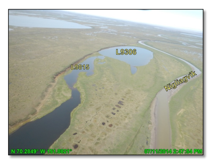
Photo B.2: Lake L9306 post breakup, looking northwest; July 11, 2014