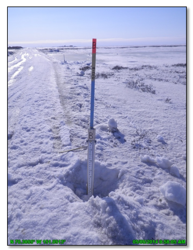
Photo 3.1: Staff gage, G32-B on Lake L9341, prebreakup; May 5, 2014

Standard differential leveling techniques were used to establish the staff gage elevation with a local TBM. Elevations of the staff gages at Lake L9341 were based on a preexisting TBM tied to British Petroleum Mean Sea Level (BPMSL) elevation.