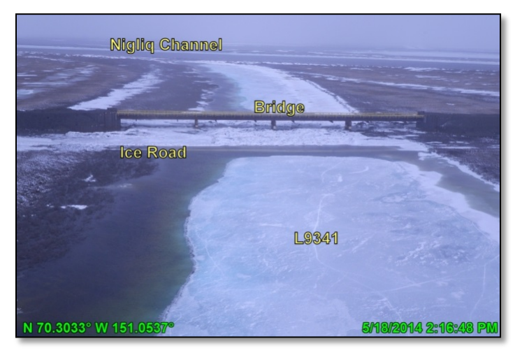
Photo B.3: Lake L9341 during breakup, looking northeast; May 18, 2014